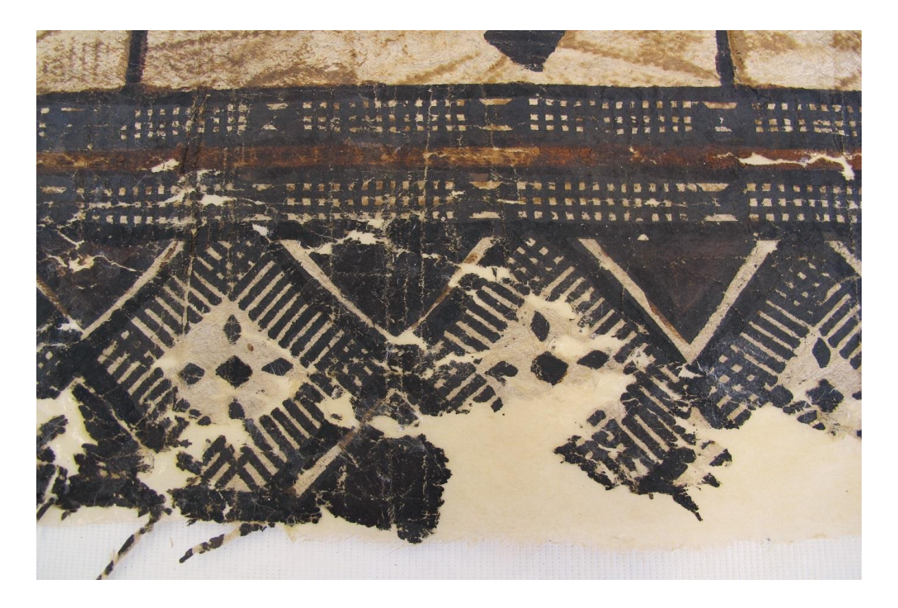
Figure 1. Conservation treatment of masi kesa, Fiji, 1986.233, 52262, by Sabine Weik: top) damaged areas at the edge of the cloth before treatment; centre) treatment in progress; bottom) after treatment.

Where delamination was apparent, wheat starch was chosen to re-bond the layers. Small holes and tears which would lead to further damage if left untreated were repaired with Japanese paper colour matched with acrylic paints and glued with wheat starch. More extensive conservation work was needed on masi where black dye had eaten away the fibres (Figure 1). All 74 masi, except the fragile dye-affected items, are now stored on rolls placed in acid-free boxes.