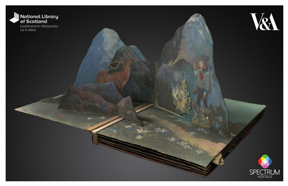
Fig. 8 3D photogrammetric model of Scene 1 ("The Stag").

Potentially, the 3D models are an excellent supplementary resource for the V&A, as they allow the inaccessible pages to be shown alongside the one which is currently on display. In addition, the models can be viewed at any time of day or night from any location across the world. Essentially, with the proliferation of smartphones, Scotland's largest popup book has become pocket-size! In due course, the Library's digital team, or perhaps its readers, may use the 3D models in a truly creative way. For example, the play could be re-staged in Virtual Reality by inserting actors or animations. There is a lot of scope for enabling audience interaction, which is entirely appropriate given that this was actively encouraged in the original production.