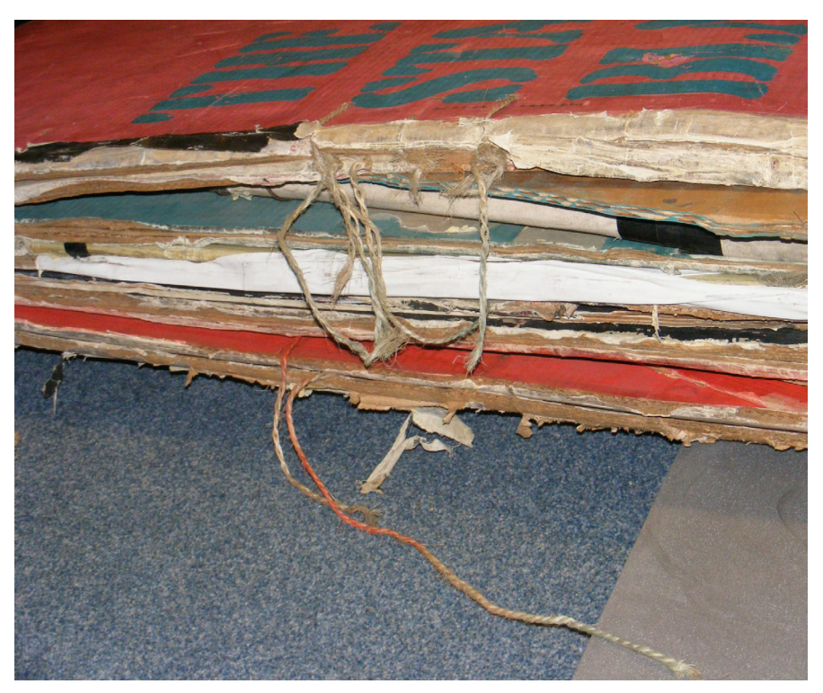
Fig. 4 Photograph showing the dilapidated spine of the stage set before treatment, 2009.