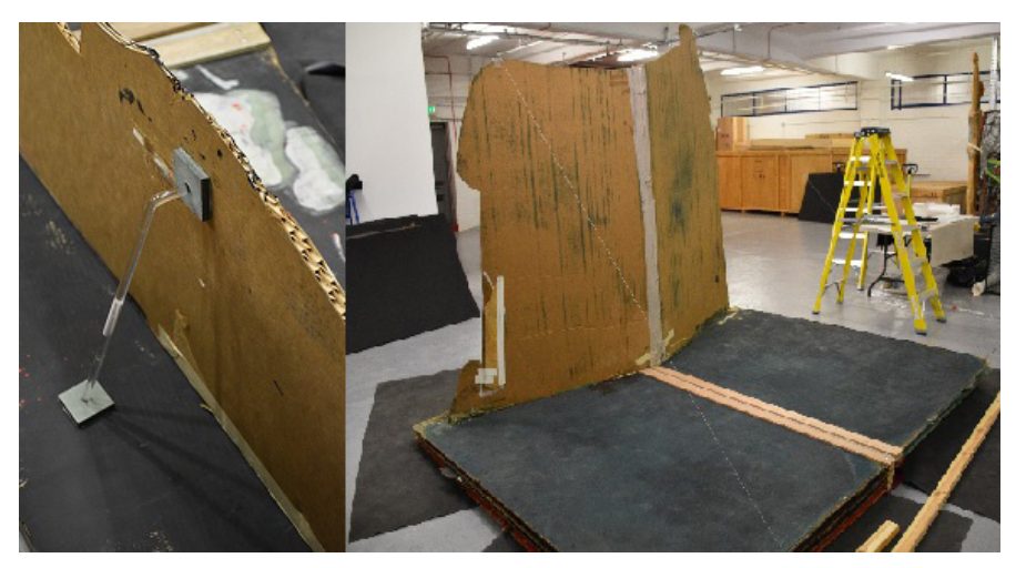
Fig. 6 Views from the verso, showing a Perspex rod in situ (Scene 3: 'The bloody wall'), and the 'guy-ropes' (Scene 2: 'The Cottage').

the stage set. The cords and the rods were designed to be as visually unobtrusive as possible. Further minor repairs were undertaken in 2018; the stage set was lightly cleaned with a conservation vacuum, and the creased/damaged pop-ups were consolidated from the verso with Japanese paper. Areas worked on included the Chief's headdress and the Stag's nose.