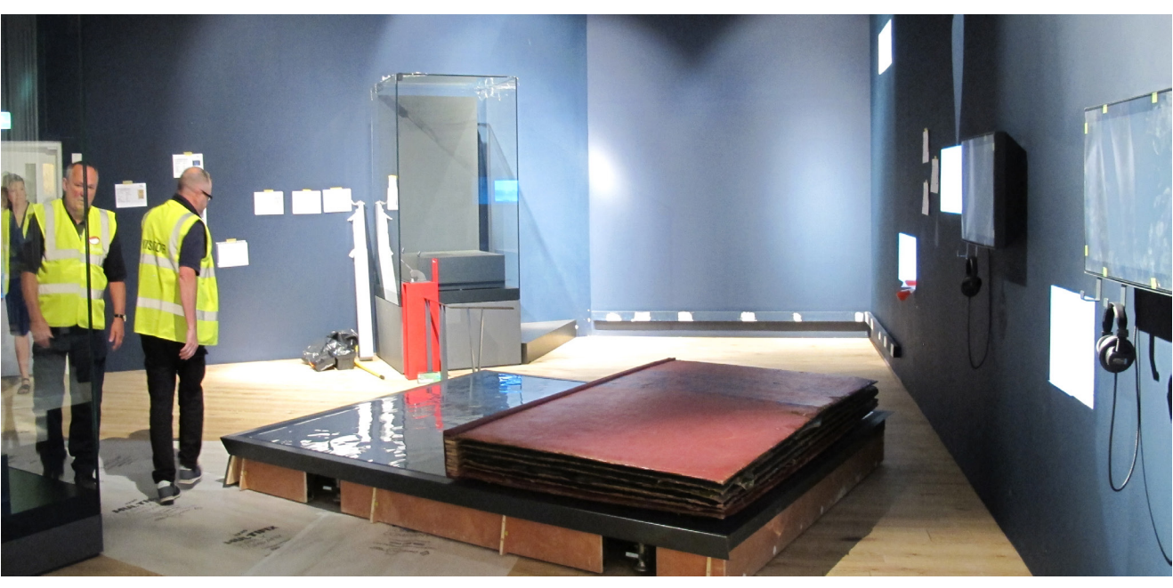
Fig. 10 The stage set resting on its new plinth during the installation at V&A Dundee, August 2018.

12\; John Byrne, 'Interview with the author', 12 June 2018, National Library of Scotland.