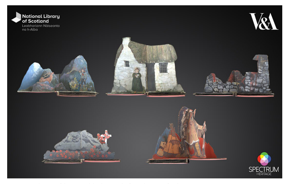
\textbf{Fig. 5} \ \ \text{Digital image of the 3D models, showing the front elevation of each scene.}

furnished with a group of cardboard pop-ups. The tallest pop-up measures 220 cm from floor to tip. When closed, the footprint of the book measures 260 by 306 cm. The pop-ups, originally hinged with brown gummed tape, were raised using an intricate arrangement of cords and pulleys. Entirely visible to the audience, these hinted at a Brechtian sensibility. In the play, fictional scenes are mixed with factual readings and music to evoke the atmosphere of a Scottish ceilidh. McGrath intended the play to be an immersive and participatory experience that would engage the audience on an emotional and an intellectual level. Reminiscent of a children's picture book, the painterly quality of the stage set is a deliberate and evocative part of the play's styling.