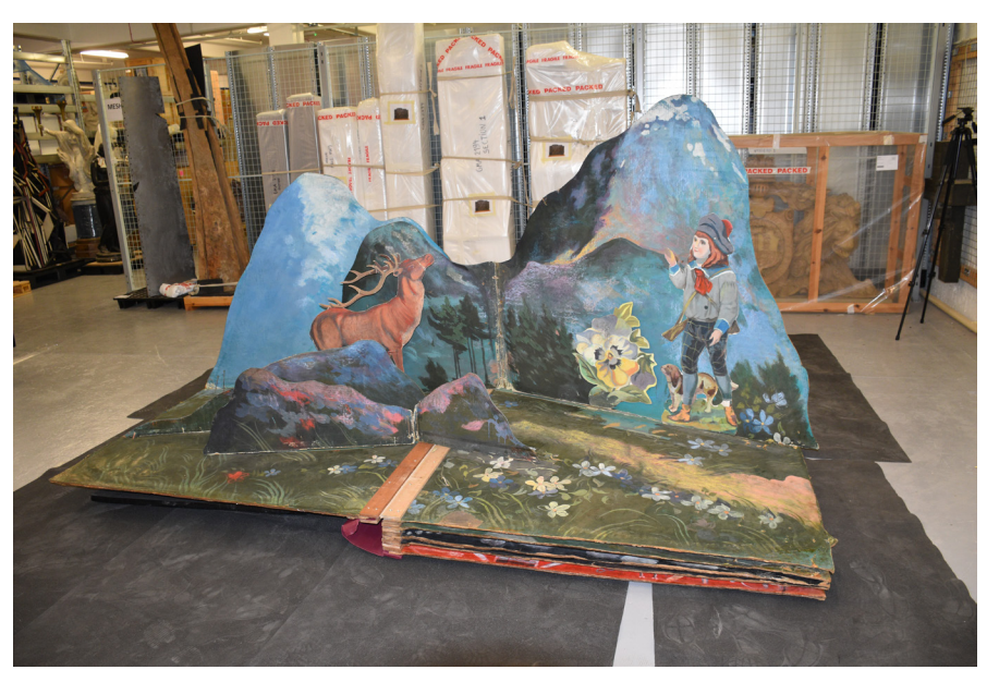
Fig. 1 Original stage set for The Cheviot, the Stag and the Black, Black Oil. View showing Scene 1 ('The Stag').

1 John McGrath, The Cheviot, the Stag and the Black, Black Oil , ed. Graeme Macdonald (London: Methuen Drama, 2015).