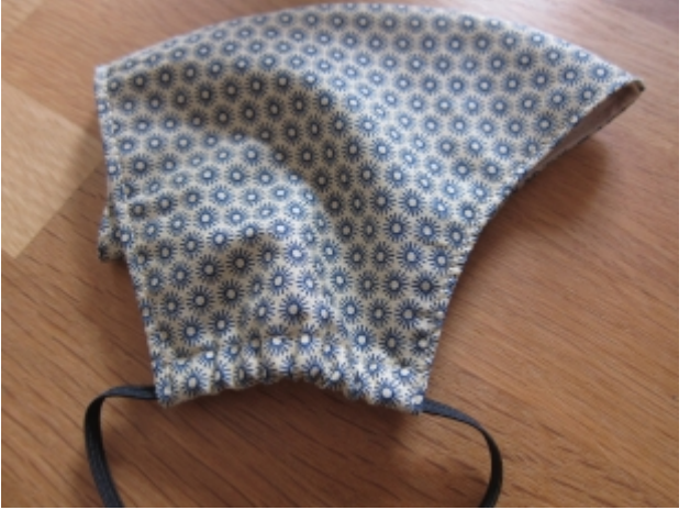
Stitch a small tuck and insert elastic