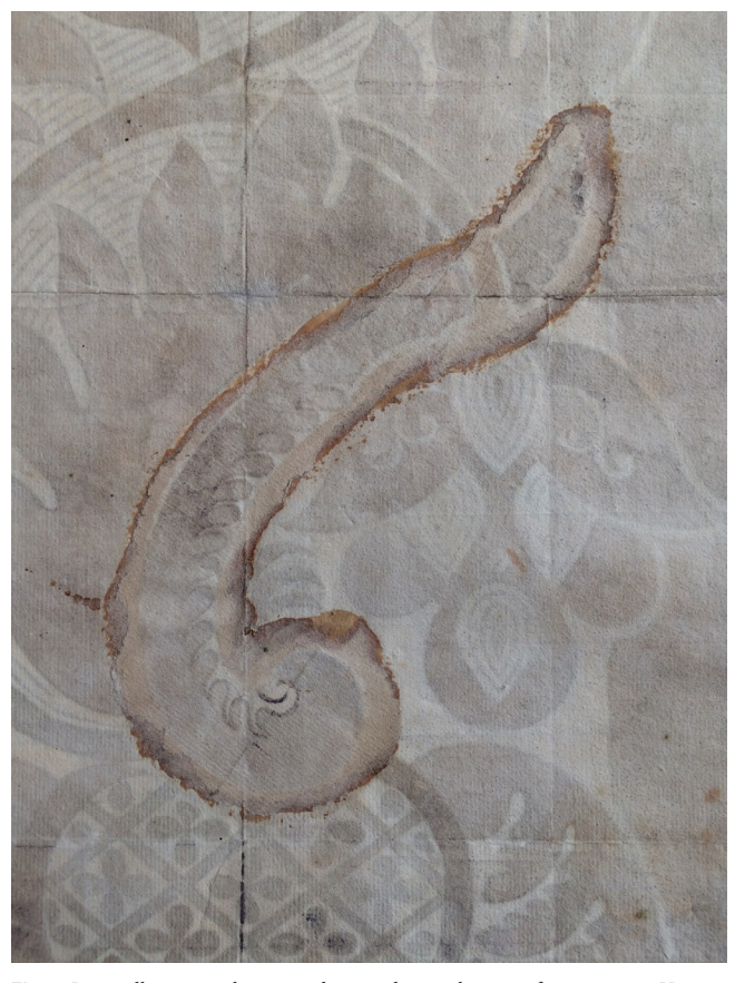
\begin{tabular}{ll} Fig.~4 Image~illustrating~the~inserted~paper~design~alteration~from~verso. \\ \end{tabular}

His pattern sources and resulting designs clearly illustrate how fashionable he was and how wide his net was thrown. Research has revealed one probable source that is of particular in-