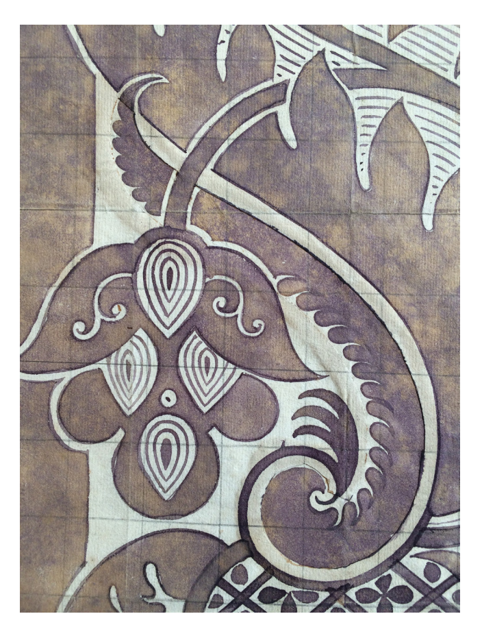
Fig. 5 Image illustrating the inserted paper design alteration from verso.