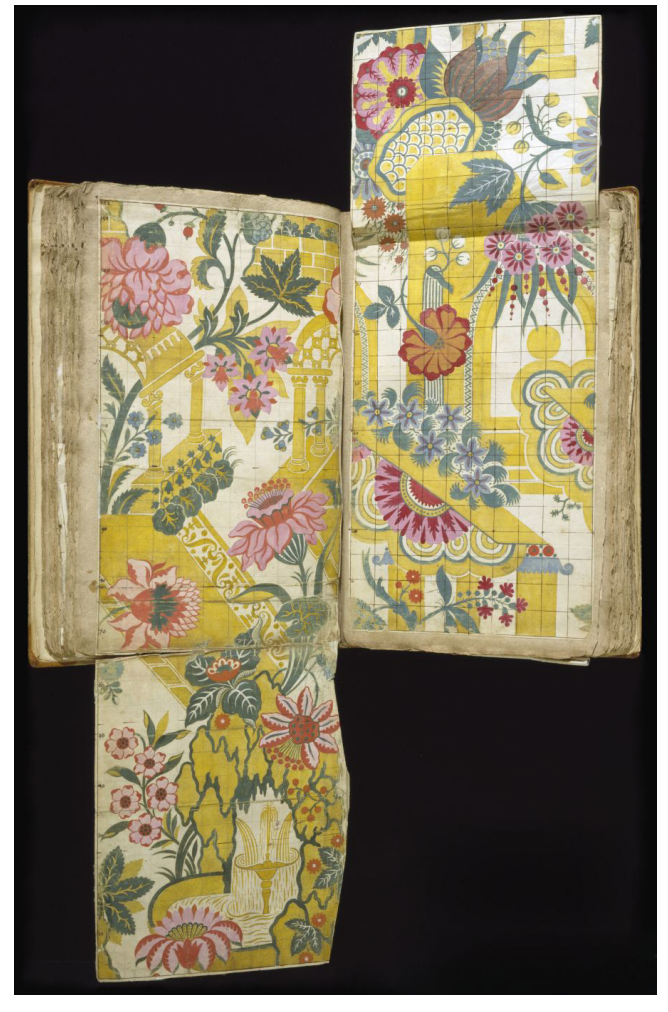
Fig. 2 Image showing problems of format for housing the designs when still bound.