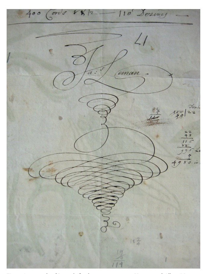
{\bf Fig.~1}~ An example of Leman's flamboyant signature.