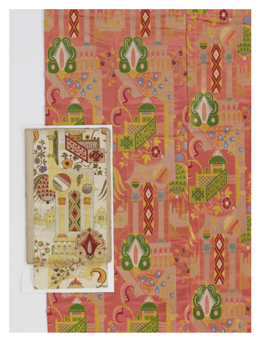
Fig. 7 Design and silk.

The inscription illustrated in Fig. 8 demonstrates that Leman's use of colour was not always prescriptive but representative of either a certain metal thread to be used ('the "pail red" is plain gold; the orange is frost gold, the blue is frost silver'), or indicative of textures: for example, the green noted here indicates damask. This type of 'coding' simplified or negated the need to paint in actual gold or silver or to produce a more complicated technique to represent textures and finishes of the woven silk.