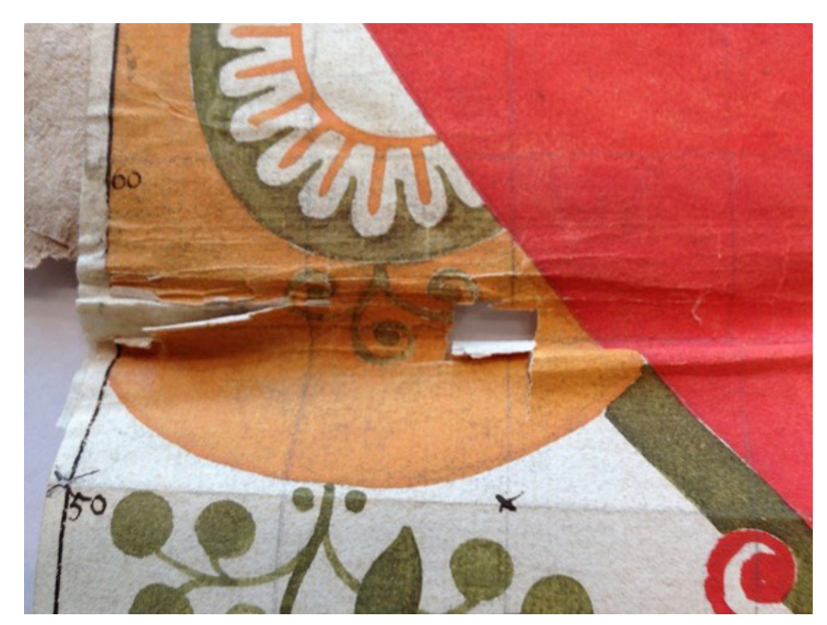
Fig. 3 Damage caused by necessity to fold designs to fit on support page.

containing green pigments, fracturing the paper support. The quality of the papers has no doubt aided their longevity. However, the papers also reflect their storage and handling history with many of the designs having regularly spaced and strong fold lines: an indication of how they were most likely stored prior to being housed in the album.