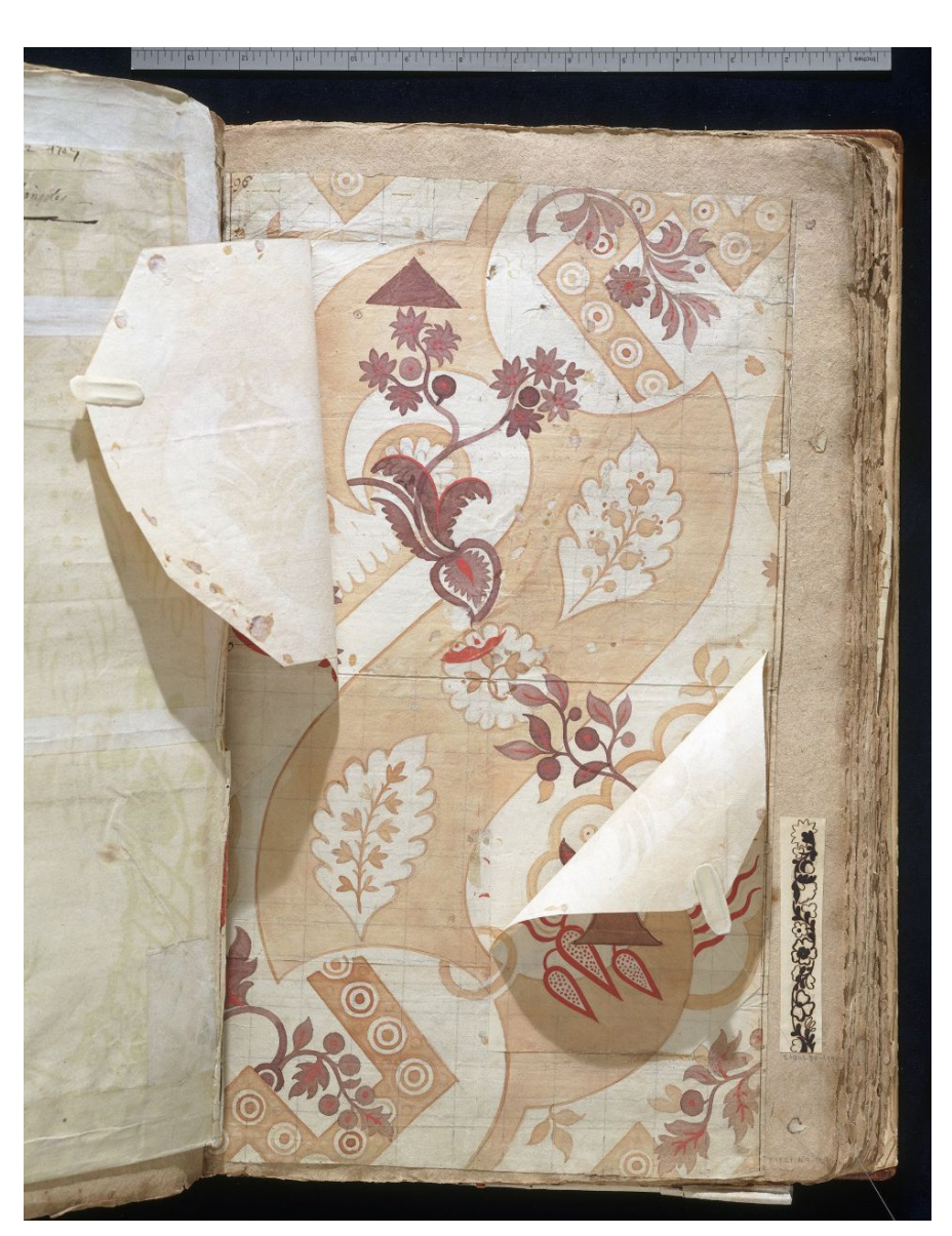
Fig. 6 Example of alteration to design using a paper overlay.

20 Written correspondence with Clare Browne.