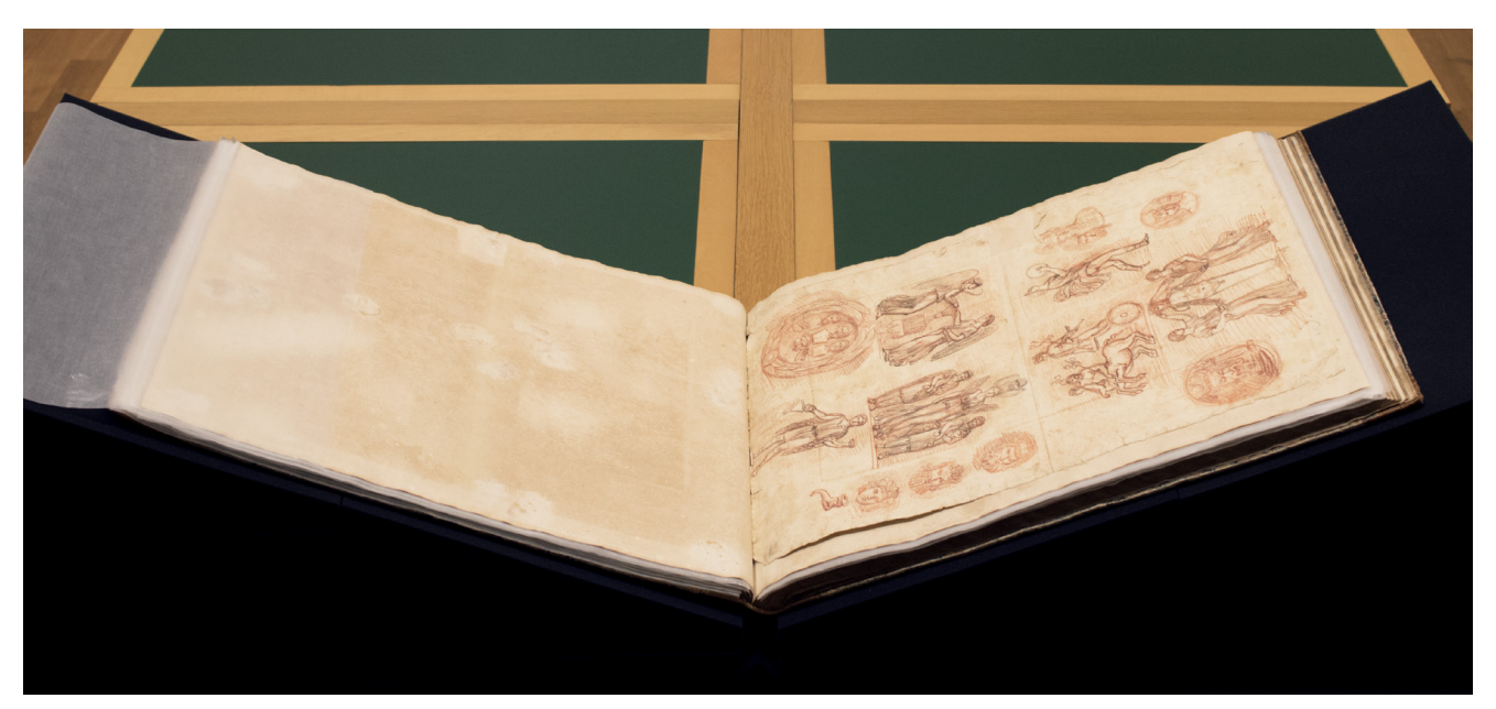
Fig. 3 Karlsruhe Piranesi Album Vol. I, opened in a book rest system originally developed by Christopher Clarkson, Staatliche Kunsthalle Karlsruhe.

As for the paper stock, most of the Karlsruhe sheets could be identified as being of Italian origin, and many share similar characteristics with the high-quality intaglio printing paper found in Piranesi's prints. Watermarks are shared by the Karlsruhe drawings and those in collections of Piranesi drawings across Europe, as well as in New York and Washington. While the stocks of eighteenth-century paper are vast and their watermarks are sparsely documented, we found variants of and, so far, a few identical watermarks that connect paper sheets from the studied group of drawings with Piranesi's printed œuvre, which was published in bound volumes. Our documentation of watermarks in selected prints has enlarged the watermark motifs compiled by Andrew Robison in 1986, thereby increasing the number of watermarks connected to prints, which can at least narrow the dating of watermarks, and, perhaps, the associated drawings. For example, a copy of Piranesi's Antichità publication at the Württembergische Landesbibliothek (ID: 472.1.2) reveals a twin to a watermark dated by Robison to 1750s–1770s, and is shared identically by a drawing in Karlsruhe (ID: IX 5159-35-23-3) and another one at the Morgan Library (ID: 1966.11:63).